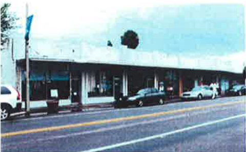
Mander Building: BEFORE