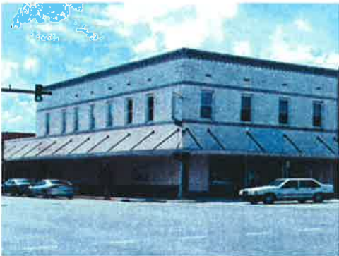
Kiefer Building: BEFORE