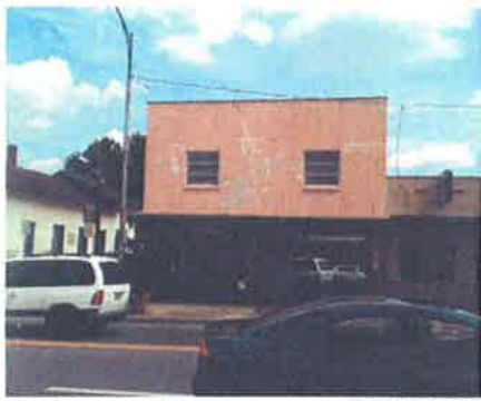
Larkin Building: BEFORE