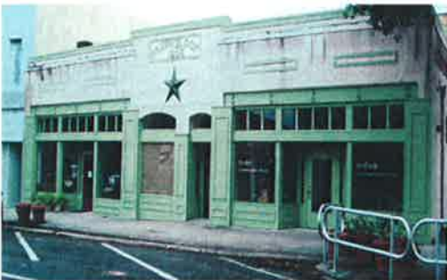
Huckabay Building: BEFORE